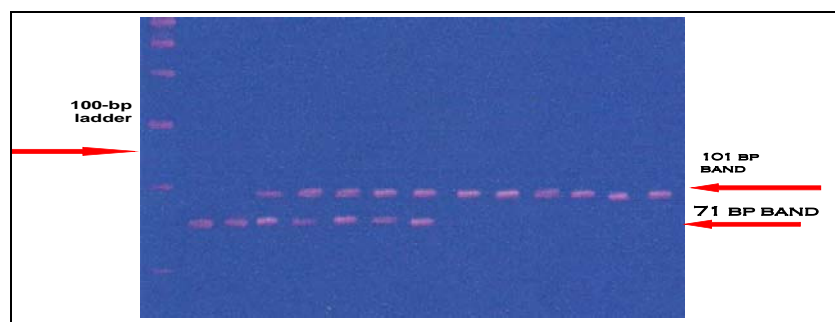
Figure 2: Agarose gel electrophoresis pattern of FSH SNP Ala307Thr showing the genotypes of homozygous 307Ala, homozygous 307Thr and heterozygous Ala307Thr. The bands corresponding to 31 and 19 bp were not shown.